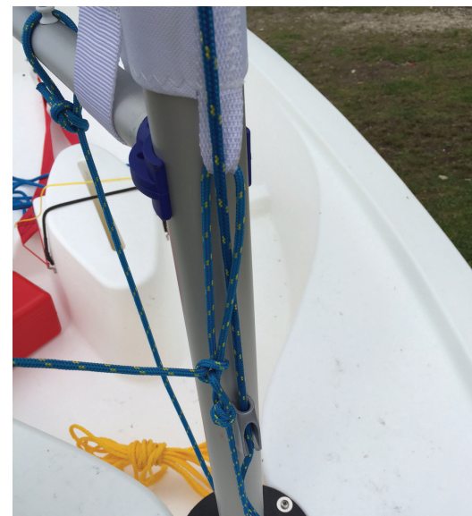
5: Tie off against itself with two half hitches