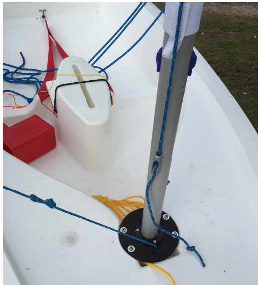
1: Locate the mast foot in the mast foot cup and identify the mast tie down

Reverse process to de-rig. Wash boat and sail. Roll sail around mast. Never remove sail from mast.