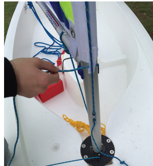
2: Thread the end of the mast tie down through the sail downhaul